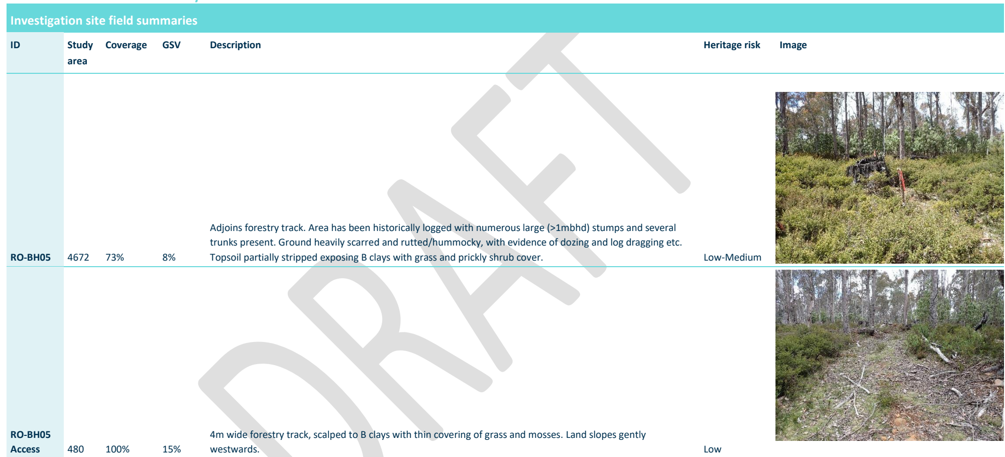
Table 2: ROB05 field summary